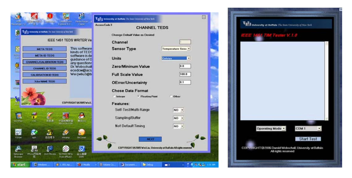
Fig.1 Compiler Screen

A Compiler and Tester for Smart Transducers based on the IEEE 1451 Standard (Cont'd)